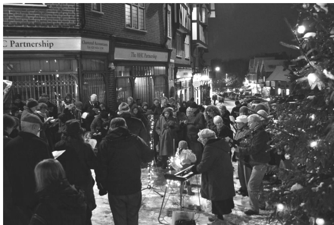
Carols by Torchlight December 2010

Thank you to all who helped in any way - let's hope the weather is kinder in 2012!